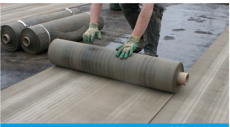
CC Batched Rolls