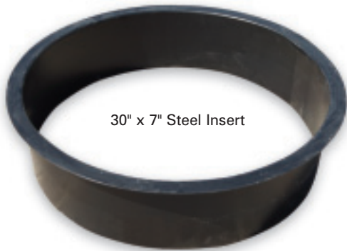
30" x 7" Steel Insert