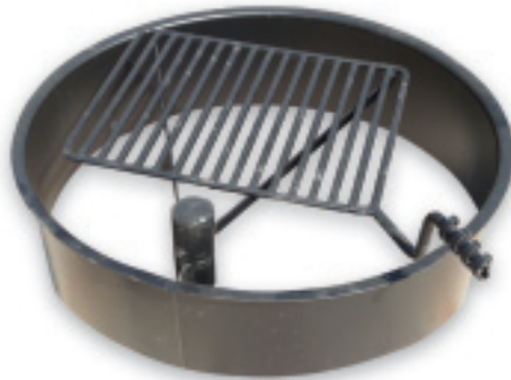
30" x 7" Steel Insert with Swivel Cooking Grate