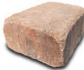
Fire Ring Block 4" H x 8" (5.3") W x 8" D 17 lbs.