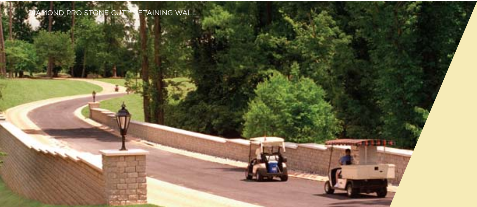
DIAMOND PRO STONE CUT™ RETAINING WALL