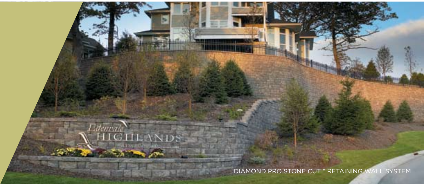
DIAMOND PRO STONE CUT™ RETAINING WALL SYSTEM