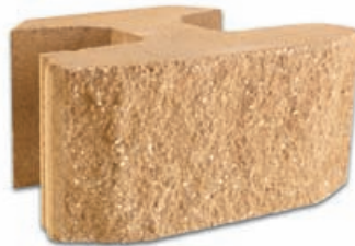
Beveled Split Size: 8" H x 18" W x 12" D 200mm x 450mm x 300mm Weight: 80 lbs., 36 kg