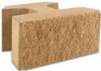
Straight Split Size: 8" H x 18" W x 12" D 200mm x 450mm x 300mm Weight: 80 lbs., 36 kg

Unit specifications, availability, color, and fascia options vary by manufacturer. Please contact your nearest Rockwood manufacturer or dealer for more information.