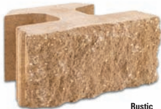
Rustic Size: 8" H x 18" W x 12" D 200mm x 450mm x 300mm Weight: 80 lbs., 36 kg

ROCKWOOD ® RETAINING WALLS A better way. ™